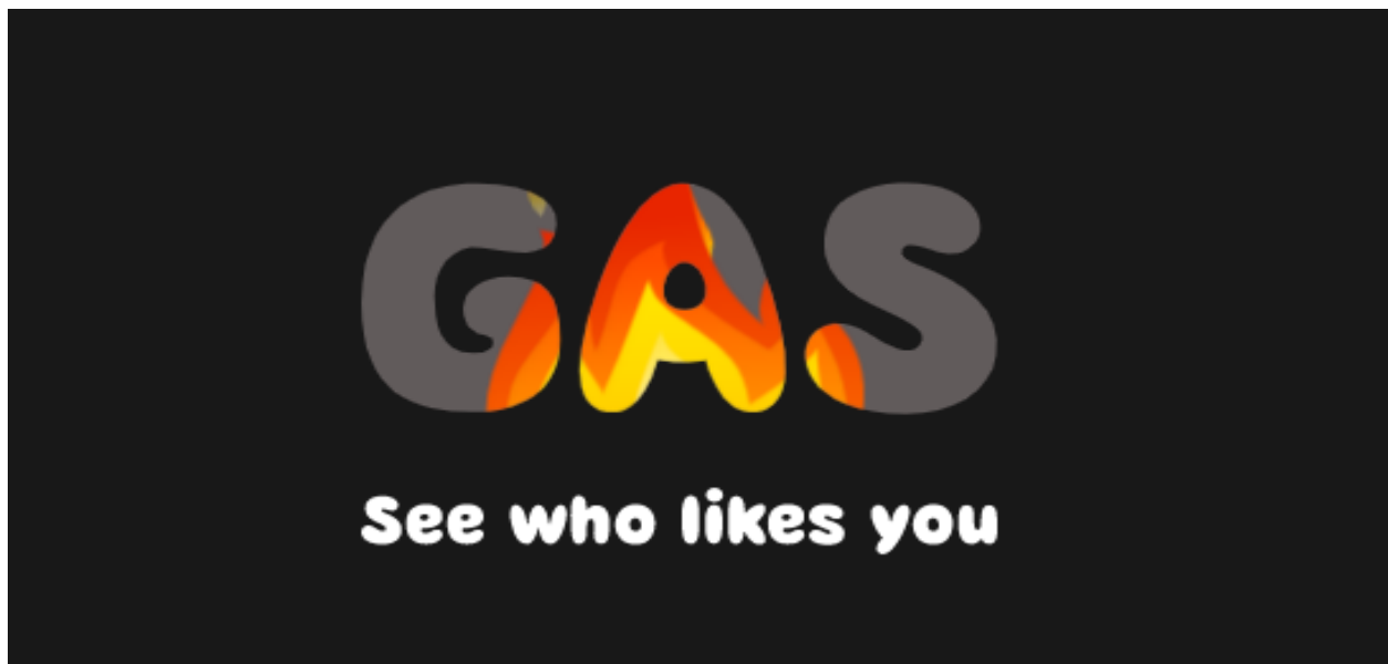
A picture of gas's logo.

Gas is an app that is designed for high school students that allow users to anonymously give compliments to their friends through multiple-choice polls. On Gas's FAQ, the developers stated, "We wanted to create a place that makes us feel better about ourselves. We hope that Gas shows you that there are people who love and admire you." The app has amassed 4.6 stars on the App Store, showing the popularity the app has gained in the short time since it's been released. It is free to download but allows users to purchase "God Mode" which gives them extra information on who voted for them in the polls.